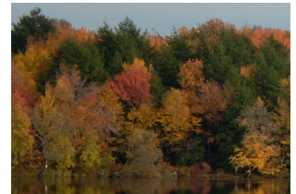
Praise God for the beauty of His creation!

If you have a praise or prayer request you would like posted in Hunger For Truth, please e-mail it to me at svtdtday@yahoo.com